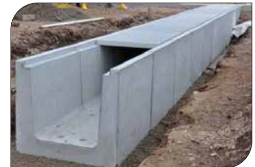
Troughs & Covers