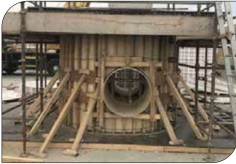
Manholes for Sewer and Drain